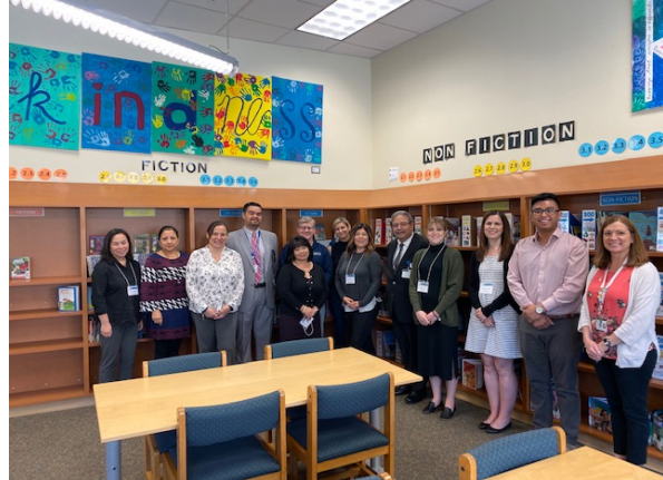
School Visit at Willow Elementary