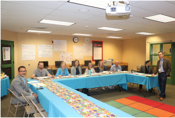
School Visit at Sunset School