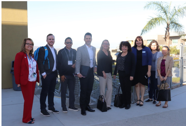
School Visit at Vista Del Mar Middle School

On Day 3, the K-12 Education Cohort & CLSEI staff split into four groups to visit Willow Elementary, Sunset Elementary, Vista Del Mar Middle School and San Ysidro Middle School. Each group met with the school principal and visited classrooms.