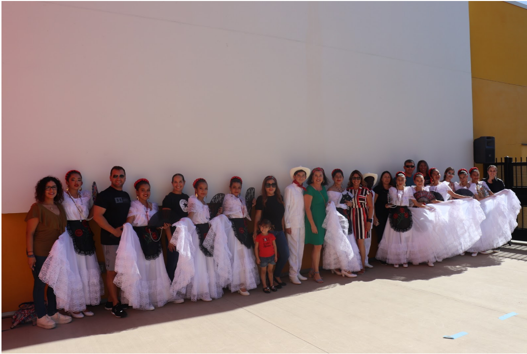
Video of the Vista Del Mar Middle School's Baile Folklorico Performance:

https://drive.google.com/file/d/0B4_Wiy0SKQVccXpPTThtc2JiOE85Qm5SRVBvSzFUNXZpTTNv/view?usp=sharing