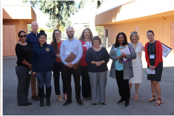
School Visit at San Ysidro Middle School